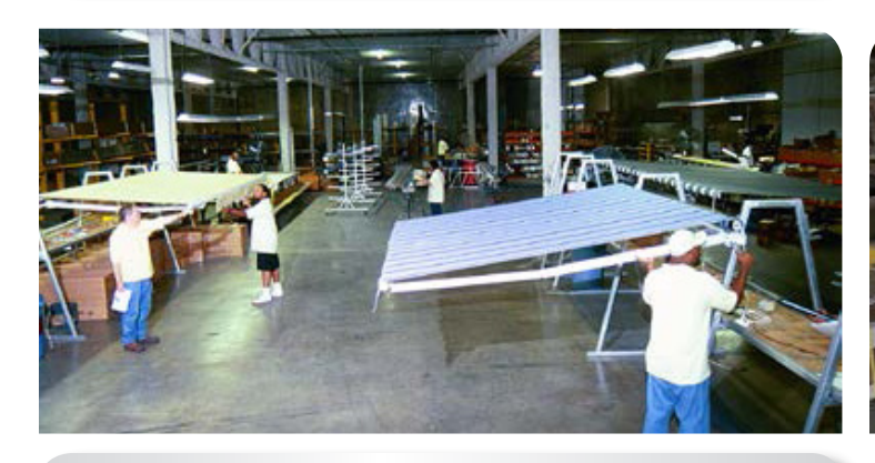
Awnings are assembled and tested before leaving our facility