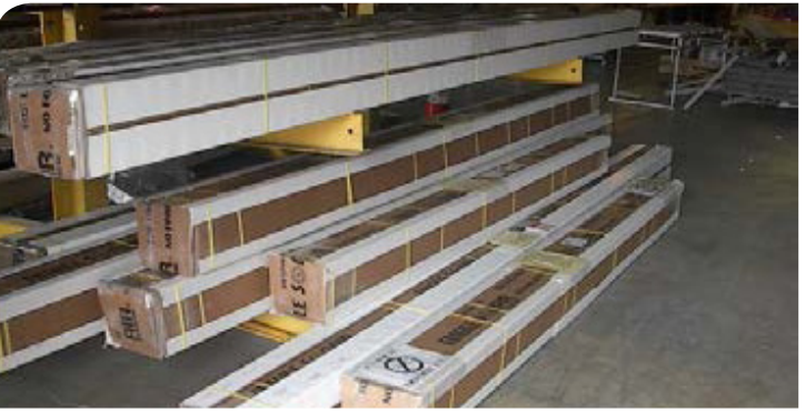
Awnings are packaged in heavy duty box materials to ensure safe transport