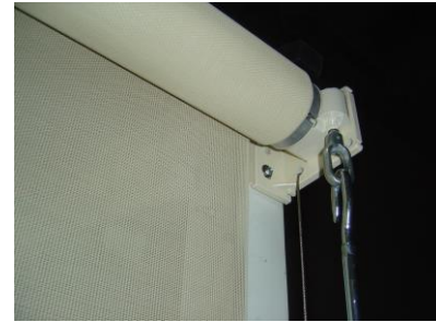
SC2500 Maxi Drop screen shown with a manual crank and guide cables (Hood optional)