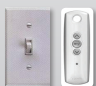
Standard Switch Remote Control

All Sunair® awning models are sewn with Tenara® thread. This thread is made from Teflon which will not deteriorate from sun exposure.