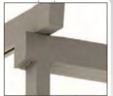
with Tecnic Profile