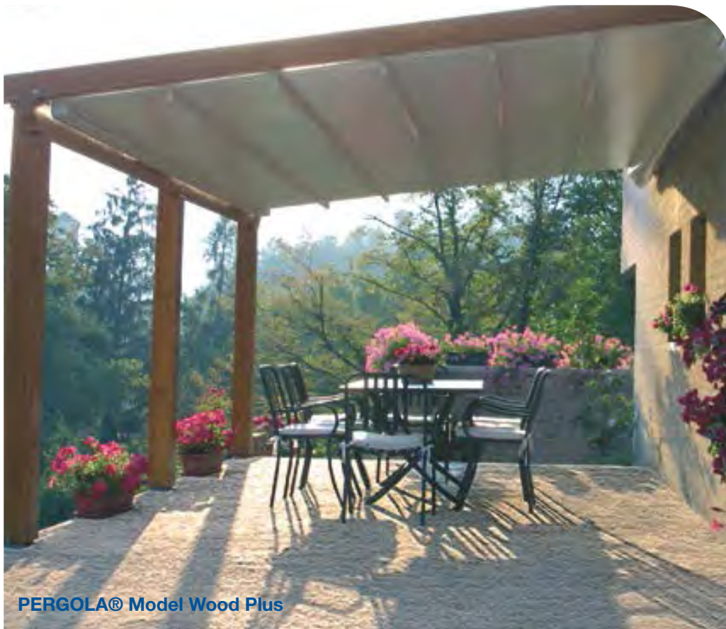
PERGOLA® Model Wood Plus

All Pergola® models are custom built to fit each area. The fabric is manufactured in one piece, even on wider awnings to prevent water leaking. Wider units therefore have multiple framing supports added to ensure a strong framework. Multiple units can also be mounted together with a gutter system in between for even wider widths. An integrated guttering system avoids water leakage.