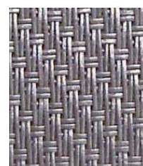
6% Open Mesh