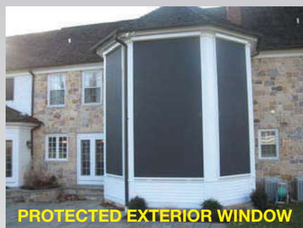
PROTECTED EXTERIOR WINDOW

The Mastershade® screen system with the fabric lowered, blocks glare and controls sun light while allowing an unobstructed view through the glass.