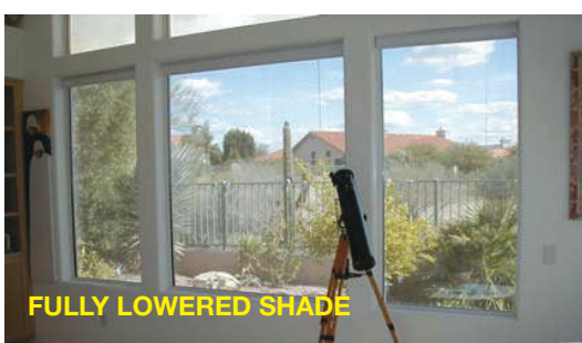
FULLY LOWERED SHADE