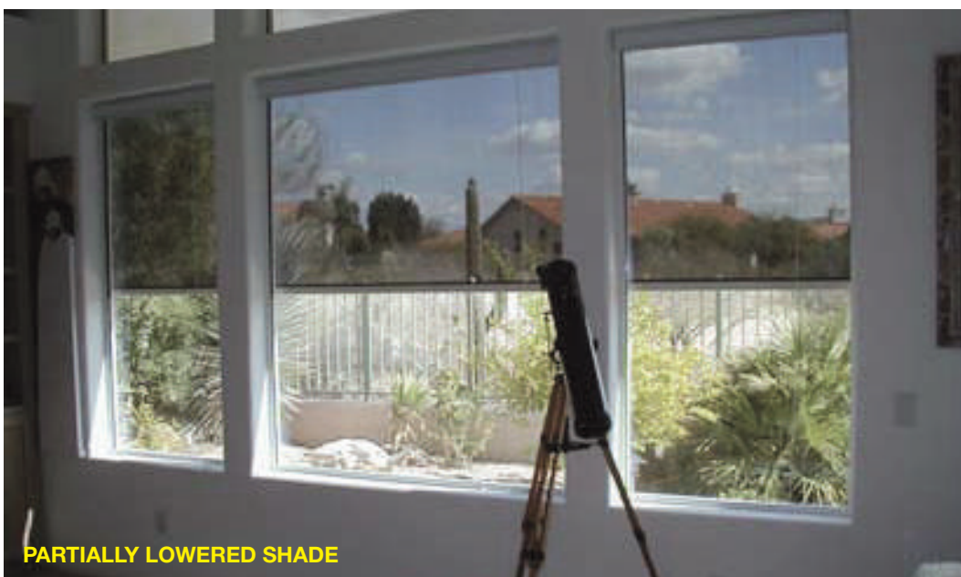
PARTIALLY LOWERED SHADE

The MASTERSHADE® screen system by Sunair® is the perfect solution for maintaining shade and comfort in your home or office. The Mastershade® dramatically decreases heat and glare caused by the sun and is the ideal solution for solar protection, shading or total black out by controlling or blocking the sunlight that penetrates your windows and doors. Our shades also protect your furniture, curtains and floor coverings. Imagine sitting at your computer or watching TV without being disturbed by too much sunlight and still having a view of the outside.