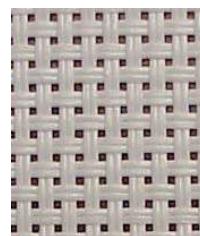
14% Open Mesh