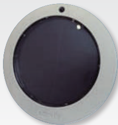
Sunis Sun Sensor

SOMFY RTS MOTORS feature an integrated radio receiver that allows you to operate the screen by remote. With the optional SUNIS sun sensor and EOLIS wire free motion/wind sensor the awning automatically extends and retracts with the sun's intensity and exposure to excessive wind.