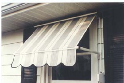
Awnings in normal down position