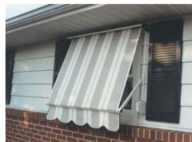
Awnings lowered 160° for privacy