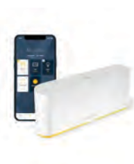
The TaHoma Switch control up to 60 Somfy products

By motorizing your Sunair® screen you can lower and retract your screen effortlessly. In fact, motorizing your screen will increase your usage of the product and overall satisfaction. The motors also do not require any maintenance.