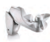
Soliris RTS 24V Kit Sun & Wind Sensor