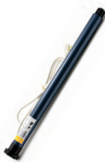
Altus RTS motors with plug-in cord