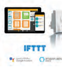
myLink RTS Smartphone & Tablet interface