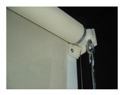
SC2500 Maxi Drop screen shown with a manual crank and guide cables (Hood optional)